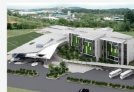
TAYLOR'S INTERNATIONAL SCHOOL