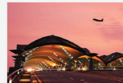
KL INTERNATIONAL AIRPORT