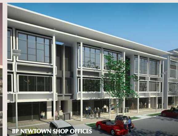
BP NEWTOWN SHOP OFFICES