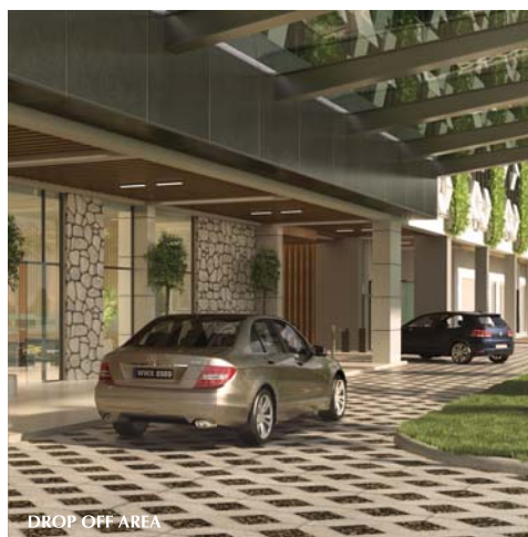
DROP OFF AREA

Open For Sale 1300 88 3888 www.epicsuites.com.my