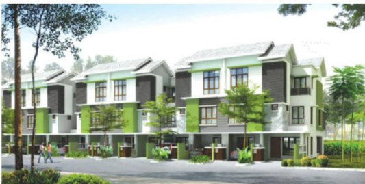
Park Villa townhouses is a gated residency development by TAHPS Group Bhd (now Ayer Holdings Bhd).

"When we reached 110 years old last year, we decided to rebrand ourselves into a brand which stakeholders can immediately identify with and to differentiate ourselves further."